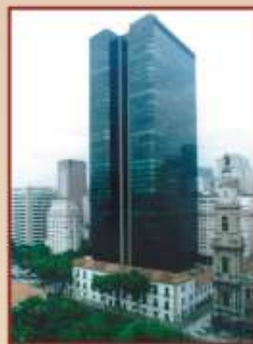
Candido Mendes University